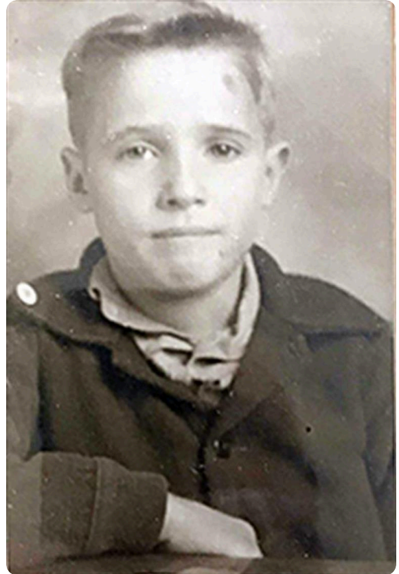
8 years old