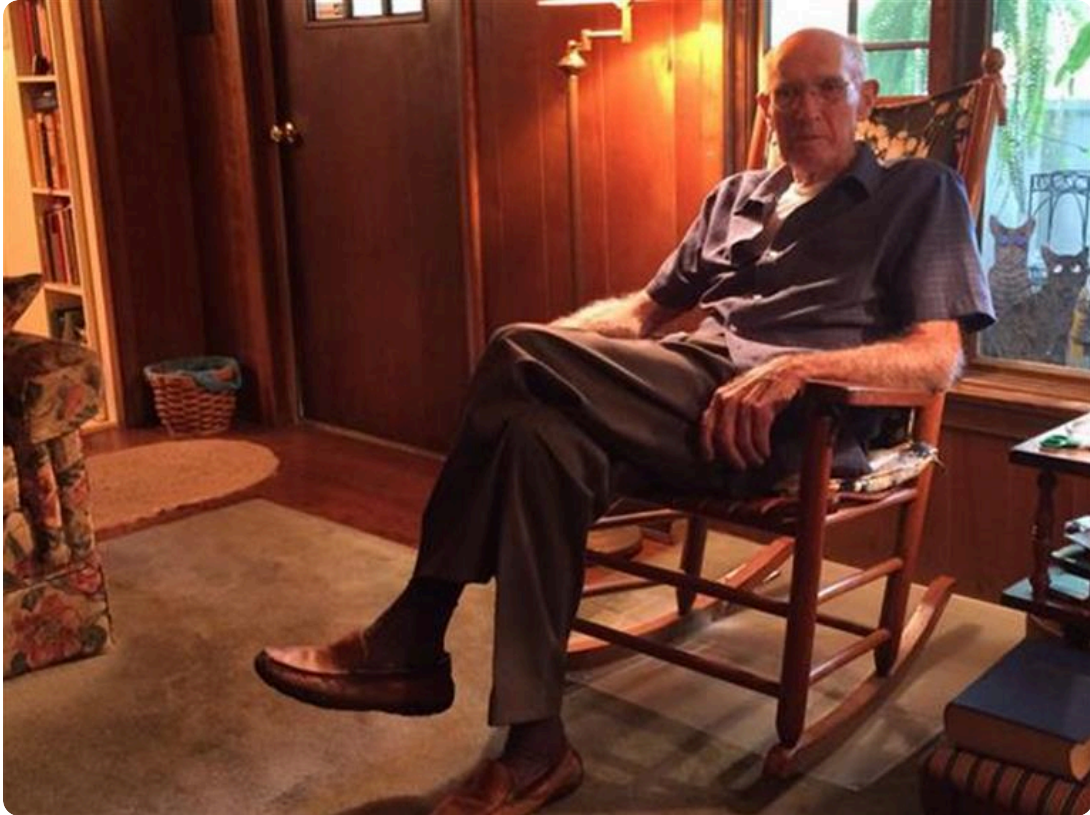
At home, just after his 90th birthday.