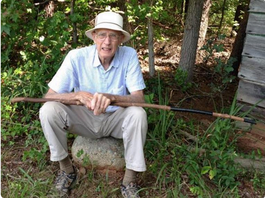
WEM on the original Morrison land.